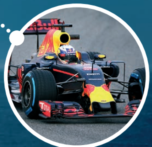
Sports & Events