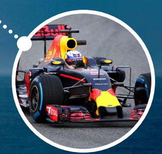
Sports & Events