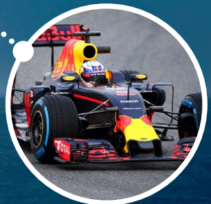
Sports & Events